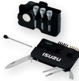
Golf Multi Tool $12.00