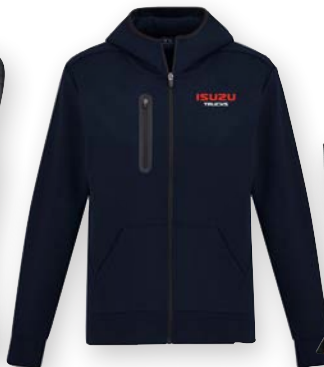
Neo Hoodie $68.00