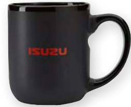
Black Coffee Mug 480ml $13.50