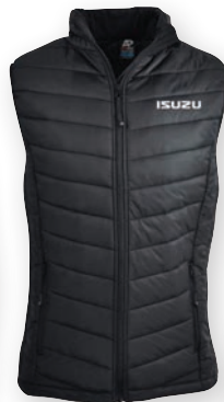
Snowy Vest $64.00