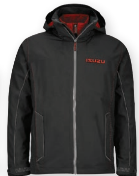
2 in 1 Jacket $157.00

Apparel available in various sizes. Contact your local dealer for more information.