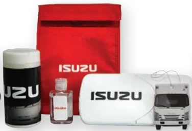
Service Pack $26.50