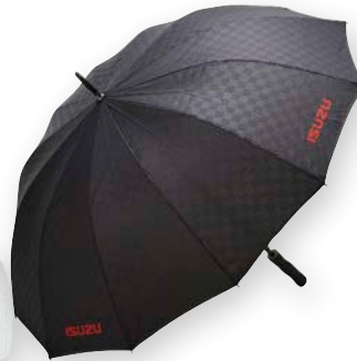
Boss Umbrella $48.00