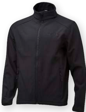
Softshell Jacket $62.00