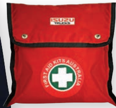
First Aid Kit $73.00