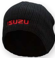
Cable Knit Beanie $9.50