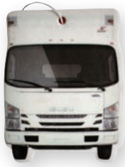
Air Freshener $2.35