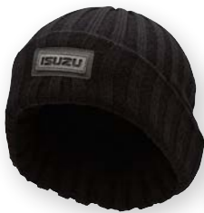
Badge Beanie $16.00