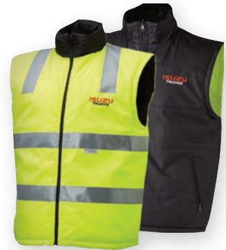
2 in 1 Hi Vis Vest $60.00